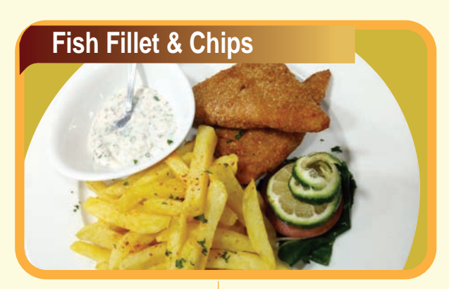
(Kshs 1,800 - USD 18)