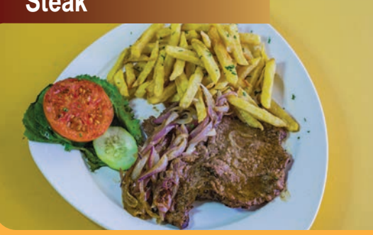
Minute Steak / Pepper steak (Kshs 1,800 - USD 18)