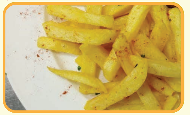
French Fries (Ksh 400 - USD 4)

Marinated chicken wings pan-fried in onions and coriander, cooked with or without chillies (Kshs 500 - USD 5)