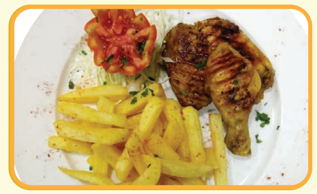
Grilled Chicken leg served with Chips (Kshs 1,800 USD 18)

Crunchy crispy fresh tilapia little fingers served with tart are sauce (Kshs 700 - USD 7)